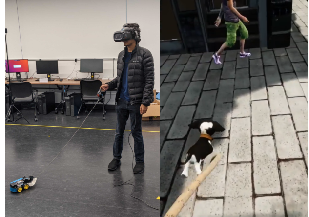
Fig. 1. An image of a user in the physical environment (left) and virtual environment (right) in our implementation of active haptic guidance. The user is tethered to a robot in the physical environment and to a virtual dog companion in the virtual environment. The robot provides haptic feedback to the user according to the virtual companion’s movements, which improves the user’s sense of presence in the virtual world and encourages the user to avoid the boundaries of the virtual reality system’s tracked space.