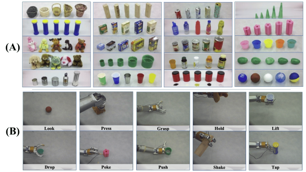
Fig. 2: (A) 100 objects, grouped in 20 object categories. (B) The interactive behaviors that the robot performed on the objects.

2) Multimodal Fusion: We employ a self-attention mechanism to integrate the feature sets from the three modalities. Beginning with the concatenation of feature vectors from each modality, we apply a two-step process: first, conventional multi-head self-attention [32] is applied to the concatenated features; subsequently, the resulting output is directed through a Multi-Layer Perceptron (MLP) to yield