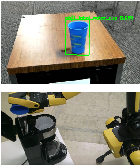
Fig. 3. Upon reaching a new locale, the robot observes the water cup and adds it to the MDP (left). With the water cup observed, Spot can plan to pour the water into the coffee machine (right).