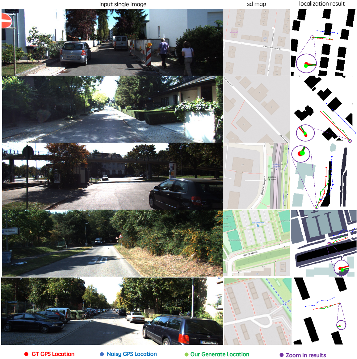
Fig. 3. The localization results of our method on the KITTI dataset. In these visualizations, the red trajectory represents the ground truth (GT) GPS trajectory from the dataset, while the blue trajectory is the noisy GPS trajectory we synthetically generate. Given the noisy blue trajectory and a single image as input, our method produces the refined green "Generated Location" trajectory.

\{\mathbf{p}_t^{\text{gps}}\}_{k=1}^{\text{anchor}} and predicts classification scores \{\hat{s}_k\}_{k=1}^{N_{\text{anchor}}} and denoised trajectories \hat{\mathbf{p}}_{k=1}^{N_{\text{anchor}}} :